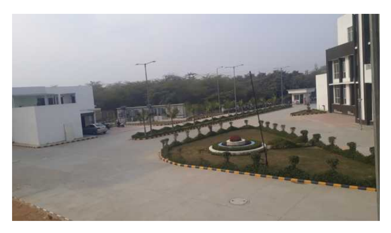
ROAD WORK - 56.26 % COMPLETED.